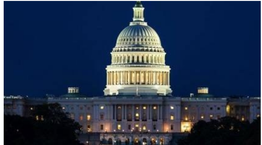
Congressional Microbusiness Caucus Microloan Modernization Act